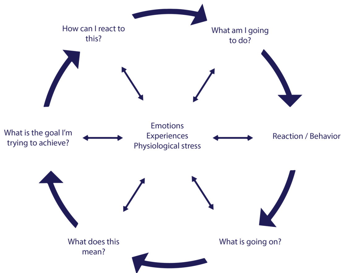
Figure 2. Theoretical framework of VRAPT. Based on the social information processing (SIP) model of Crick and Dodge (1994).

designed in an iterative process with clinicians, VR experts, software engineers and researchers. The main focus of all sessions was teaching participants to cope with provocative behavior of others more adequately and to prevent own aggressive outbursts.